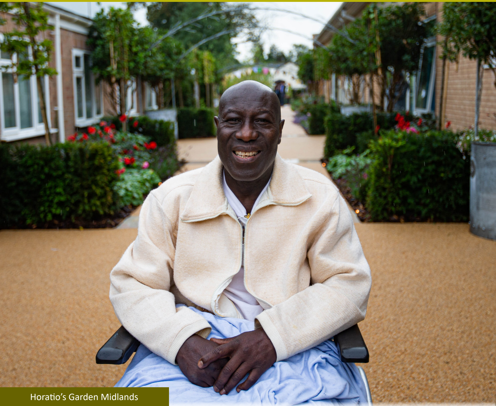
Horatio's Garden Midlands

As one of our supporters, you can make your will for free.