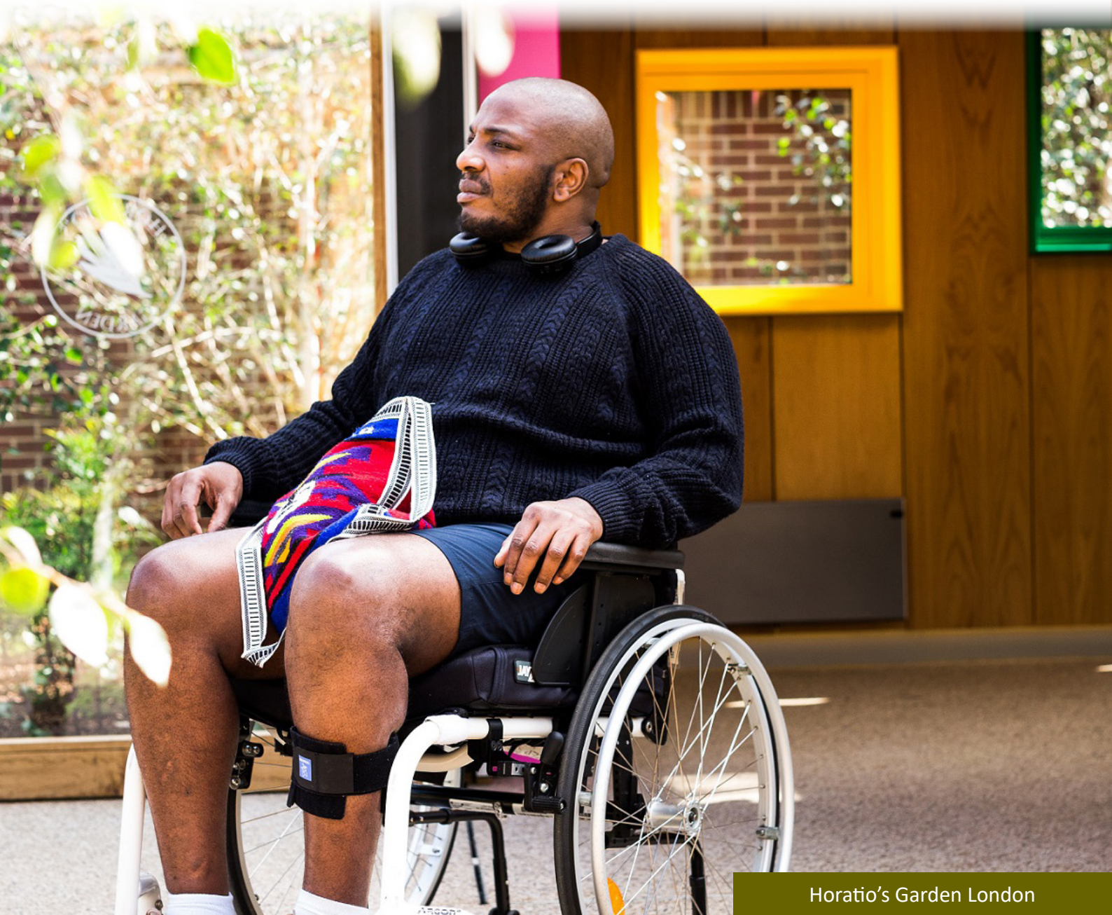
Horatio’s Garden London

Each project is all about planting hope, giving patients and their loved ones the space they need to adjust to their injuries.