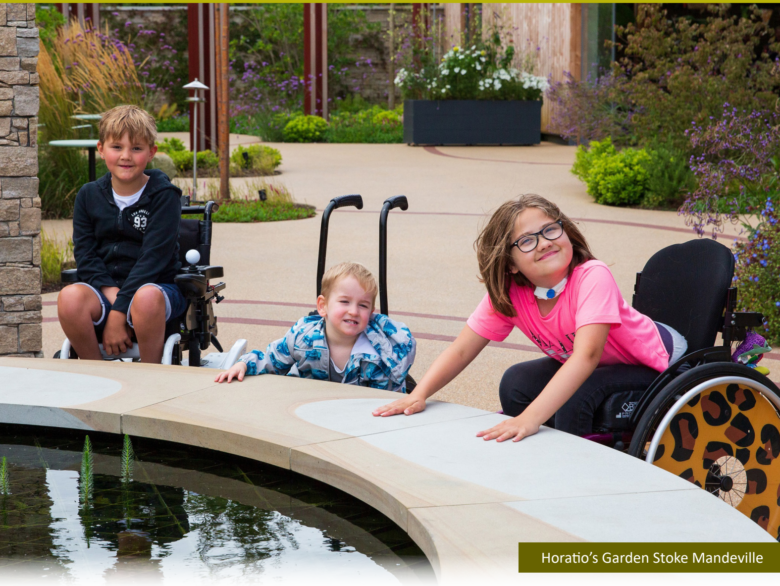
Horatio's Garden Stoke Mandeville

Thank you for your interest in supporting our vital work.