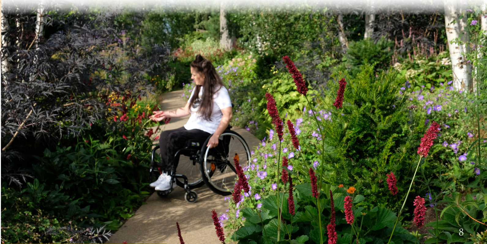
Horatio’s Garden Scotland

“I hope you know that what you do on a daily basis is far more than simply practical work. You are having a tangible, positive impact on people’s wellbeing. I can’t thank you enough.”