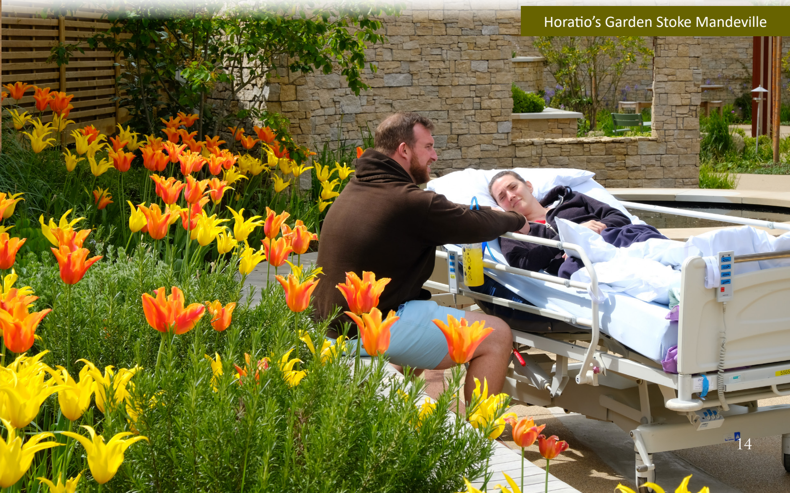
Horatio's Garden Stoke Mandeville