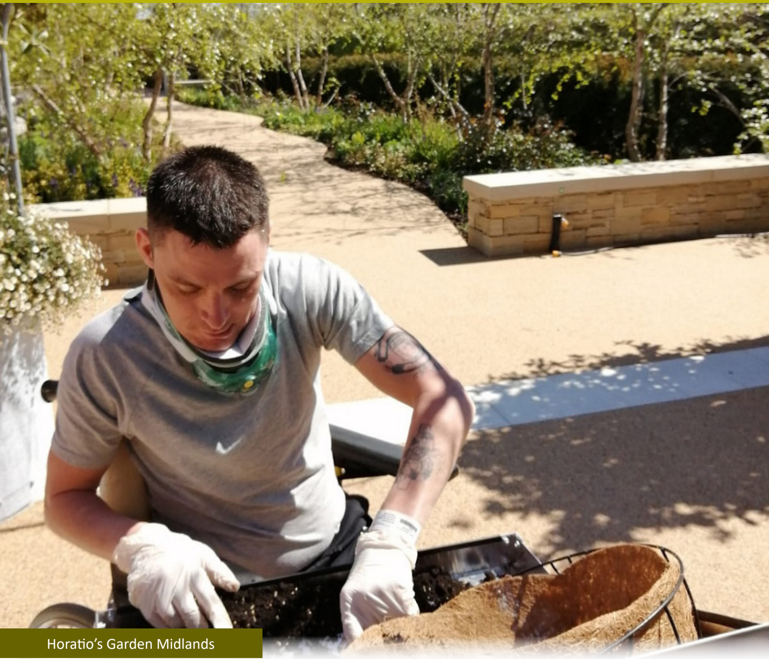
Horatio’s Garden Midlands

It costs the charity approximately £1 million to design and create a new garden and it costs a further £75,000 a year to keep the garden running.