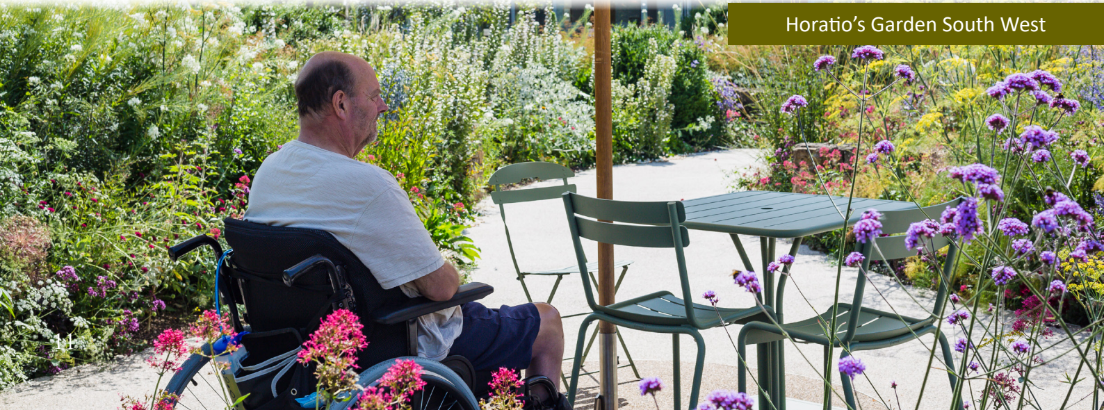
Horatio’s Garden South West

Step 5: Keep it safe and up to date. Your will is obviously a very important legal document. Most people prefer to leave it in the care of their solicitor or legal advisor and keep their own copy in a safe place, ensuring their executors know where to find it.